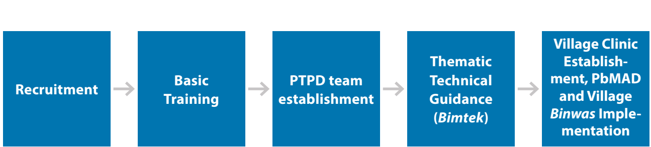
Figure 2. P-PTPD Implementation Flowchart

The P-PTPD implementation begins with training for people who have the potential to become team members in each sub-district, including those from UPTD and P3MD.<sup>20</sup> 19 For the subdistrict study locations assisted by KOMPAK, the initial training for all prospective PTPD team members was facilitated by KOMPAK in the provincial capital, together with participants from other districts. In non-KOMPAK sub-districts, there was no initial training for all PTPD team members, except for one person at a non-KOMPAK location in Bima. Apparently, the provinces of Central Java, South Sulawesi, and West Nusa Tenggara did conduct basic PTPD training funded by the Ministry of Home Affairs in 2018, but the study did not find any data regarding the trainees or even how many there were. According to the sub-district informants from the Bantaeng and Bima districts, only one participant per sub-district was trained by the Ministry of Home Affairs. Table 7 shows the overall initial PTPD capacity building.